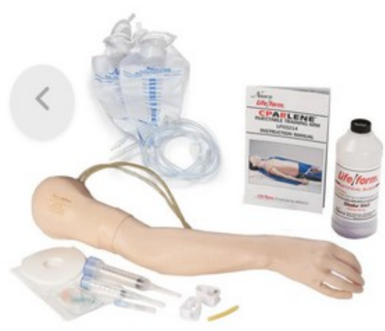
IV Arm for GERi™-KERi™, Light Skin