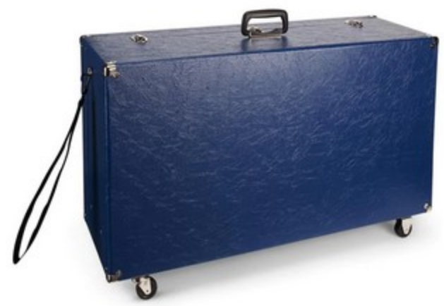
Hard-Sided Carrying Case