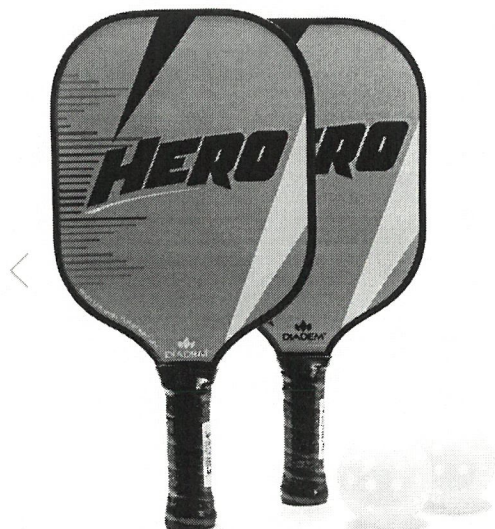
Diamond Hero Starter Kit