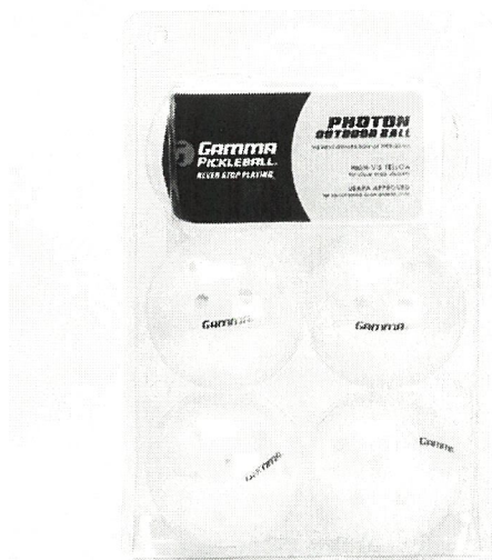
Gamma Photon Outdoor Pickleball 6 Pack