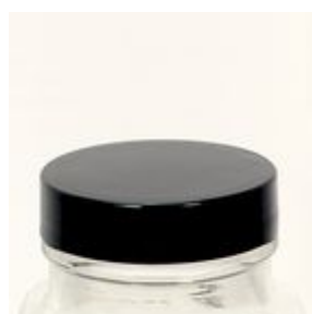
Screw Caps, Black Molded, 38 mm, Pack of 12