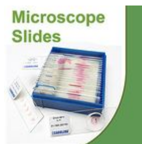
Deluxe Slide-Making Set