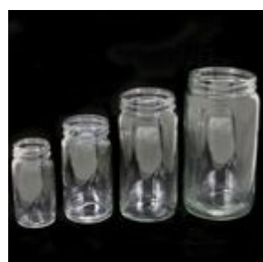
Specimen Jar, Glass, Screw-Cap (Not Included), Tall Form, 2 oz, Pack of 12, Cap Diameter 38 mm

Due to extremely high volumes in parcel (or package) shipments nationwide, you might experience shipping delays. If you think your order might be affected, contact us for more information.