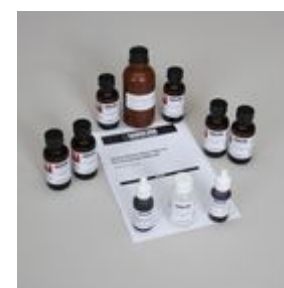
Onion Mitosis Stain Set