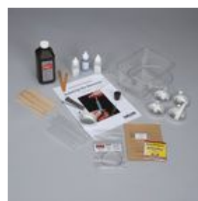
Carolina Chemonstrations®: Isolating the Elements