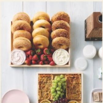
Breakfast & Brunch Platters & Trays