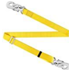
Trsmima Hunting Safety Harness, Tree Climbing Belt Restraint Lanyards, Safety Adjustable Lanyar... 484

Amazon's Choice in Restraint Ropes & Lanyards $17.75