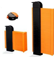
Diagtree 2 Pack Contour... 98