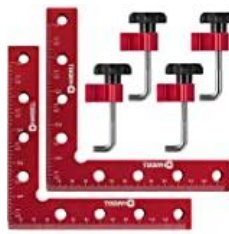
HARDELL 90 Degree Positioning Squares Right Angle Clamps 5.5" x 5.5" (14 x 14cm) Aluminum... 429