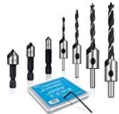
amoolo Countersink Drill Bit Set 7pcs, 4Pcs High Carbon Steel Countersink Drill Bits for Wood, 3 Pcs Hex Shank Wood... 955

Limited time deal $8.39 Was: $11.99 (30% off) Prime FREE Delivery Thursday, Sep 8 Ends in 3 days