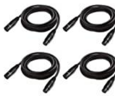
10 ft Flexible DMX Cable, JLPOW Gold-Plated 3 Pin Signal XLR Male to Female DMX Cable Wire, Best for DJ Stage Lighting Movin... 379