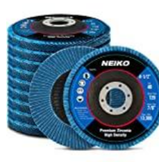
Neiko 11257A High Density Jumbo Premium Zirconia Flap Disc | 4.5" x 7/8-Inch, 40 Grit, Bevel... 1,397