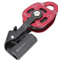
Outdoor Rock Climbing Pulley Aluminium Heavy Duty 4KN Single Swivel Rope Pulley Rescue Equipment for 8 12mm... 3