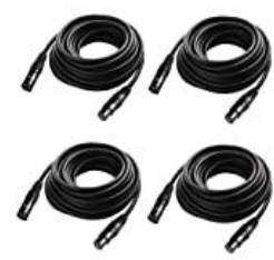
25 ft Flexible DMX Cable, JLPOW Gold-Plated 3 Pin Signal XLR Male to Female DMX Cable Wire, Best for DJ Stage Lighting Movin... 460