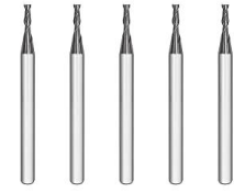
SPEED TIGER ISE... 240