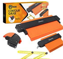
Contour Gauge Profile... 113