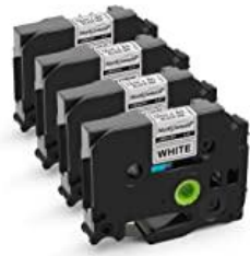
MarkDomain Compatible Label Tape Replacement for Brother TZe-231 TZ-231 Laminated P Touch... 22,484