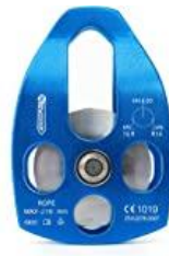
NewDoar 30 KN CE Certified Large Rescue Pulley Single/Double Sheave with Swing Plate 157