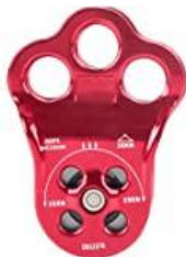
Durable Climbing Single Pulley Climbing Bearing Single Pulley Aviation Aluminum Climbing Three Hole Pulley Outdoor... 22