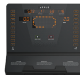
IGNITE II LED Console