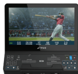
SHOWRUNNER II 16" Integrated LCD