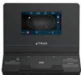
ENVISION II 9" Touchscreen