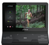
ENVISION II 16" Touchscreen