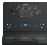
EMERGE II LED Console