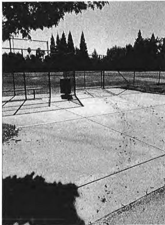
Lembi Park – Storage Location next to Field B – FLC Baseball