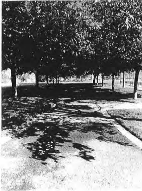
Kemp Park – Storage Location for FLC Softball (August 2019)