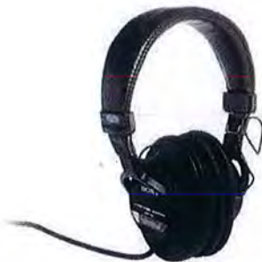
Designed for professional studio and live/broadcast applications. Click here for a larger image

The Sony MDR-7506 Professional Large Diaphragm Headphone is a large diaphragm foldable headphone designed for professional studio and live/broadcast applications. These large diaphragm, foldable headphones feature a rugged construction, a secure, highly effective closed-ear design, and a 40 millimeter driver unit for clean, clear sound reproduction.