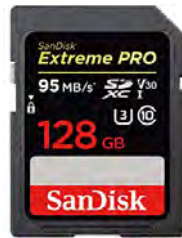
SanDisk Extreme Pro 128GB SDXC UHS-I Card (SDSDXXG-128G-GN4IN)