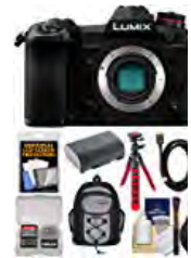
Panasonic Lumix D Wi-Fi Digital Came with 64GB Card + Flash + Backpack + Flash