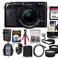
Fujifilm X-E3 4K Digital Camera & 18-55mm XF Lens (Black) with 64GB Card + Backpack + Flash...