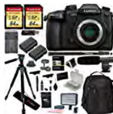
Panasonic Lumix DC-GH5 Mirrorless Micro Four Thirds Digital Camera Body, 2X Transcend...