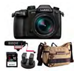
Panasonic LUMIX GH5 4K Mirrorless Camera w/Lecia 12-60mm (DC-GH5LK) w/ 64GB UHS-II + VideoMic...