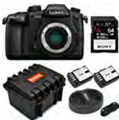
Panasonic GH5 Lumix 4K Mirrorless, 20.3 MP, Wi-Fi + Bluetooth, 3.2" LCD w/Sony 64GB SF-G...