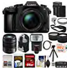
Panasonic Lumix DMC-G85 4K Wi-Fi Digital Camera & 12-60mm Lens + 45-150mm Lens + 64GB...