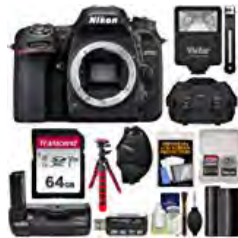
Nikon D7500 Wi-Fi 4K Digital SLR Camera Body with 64GB Card + Battery + Grip + Case + Flash + Flex Tripod + Strap +...