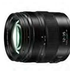
PANASONIC LUMIX Professional 12-35mm Camera Lens G X VARIO II, F2.8 ASPH, Dual I.S. 2.0...