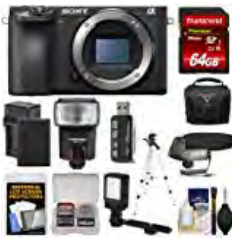
Sony Alpha A6500 4K Wi-Fi Digital Camera Body with 64GB Card + Case + Flash + Battery &...