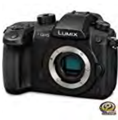
PANASONIC LUMIX GH5 4K Digital Camera, 20.3 Megapixel Mirrorless Camera with Digital Live...