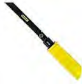
Stanley Cushion Grip Multi-Saw, Con...