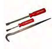
Craftsman 3 Piece Handle Prybar Set