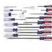
Craftsman 17 pc. Screwdriver Set