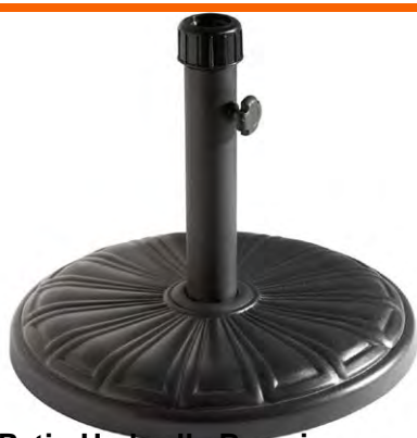
Patio Umbrella Base in Black

Experience the shade in superior comfort and style