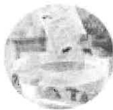
2. ADD MINERALS