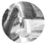
1. ADD TAP WATER