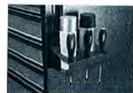
Magnetic Spray Can and Screwdriver Holder