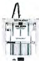
Ultimaker 2+ 3D Printer 16 $2,499.00