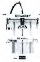
Ultimaker 2 3D Printer 24