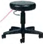
Global Industries Pneumatic Swivel Stool