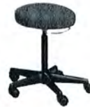
Hausmann Physician Stool w/ Hand