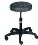
Hausmann Revolving Stool