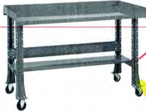
Shown With Painted Steel Top

prev See all 47 items in product family next