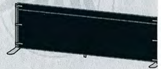
Free Standing Railskirt