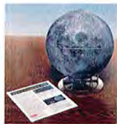
Sky & Telescope's Moon Globe