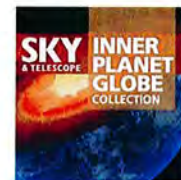
Inner Planet Globe Collection