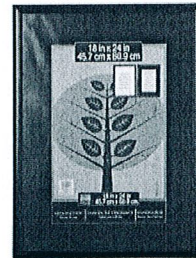
Studio Décor® Trendsetter™ Frame, Black 18" x 24" $19.99