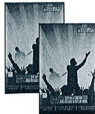
2-Pack Studio Décor® Styleline™ Poster Frame, Black 24" X 36" $39.99 $17.99