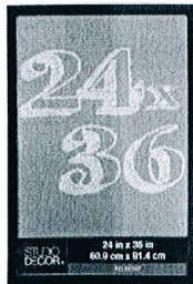
Studio Décor® Belmont Frame, Black $49.99 $14.99