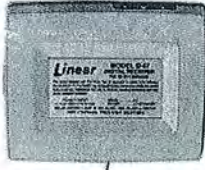
Linear SNR00032 D-67 1-Channel Wireless RF Receiver