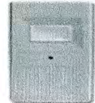
Linear D-22A 1-Channel 1-Button Handheld Transmitter