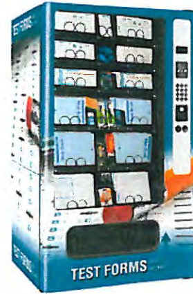
Test Form Vendor