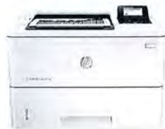
HP LaserJet Enterprise M506dn