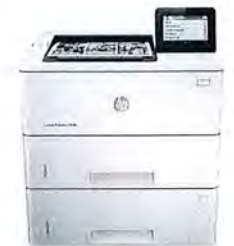
HP LaserJet Enterprise M506x