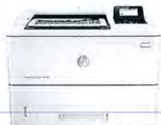
HP LaserJet Enterprise M506n

Finish key tasks faster with a printer that starts right away and helps conserve energy. 1 Multi-level device security helps protect from threats. Original HP Toner cartridges with JetIntelligence and this printer produce more high-quality pages. 2