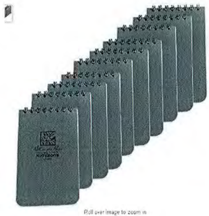
Roll over image to zoom in