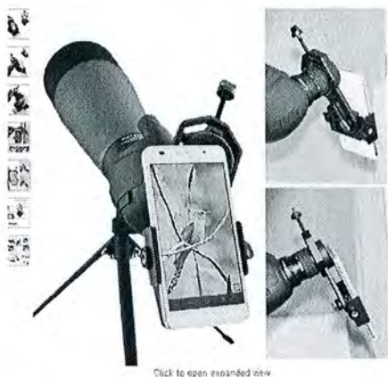
Click to open expanded view

Telescopes > Camera & Photo > Accessories > Telescope & Microscope Accessories > Telescope Accessories > Photo Adapters