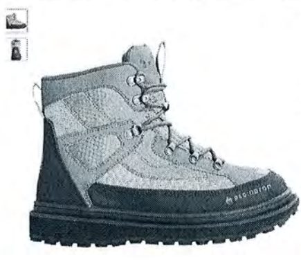
Roll over image to zoom in

Sports & Outdoors > Sports & Fitness > Outdoor Recreation > Sports & Fitness > Sports & Fitness > Footwear > Boots & Shoes