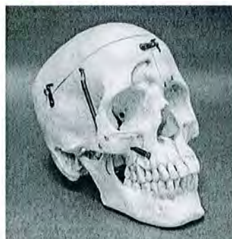
Real Human Skull - Dissected Medical Specimen Natural Bone WOK-3309

Skull Length: 20.6 cm (8.1 in) Skull Width: 13.3 cm (5.2 in) Skull Height: 15 cm (5.9 in)