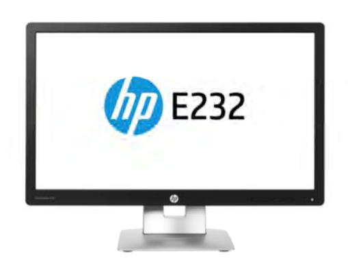
23" HP EliteDisplay E232 LED Monitor

Part # C9V73AA $165.00 E-Waste Recycling Fee $4.00