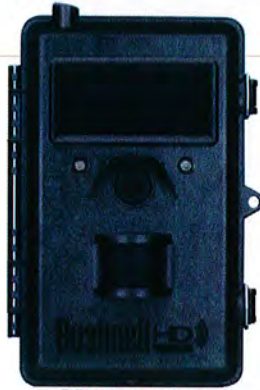
Roll over image to zoom in