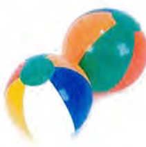
Mini Inflatable Beach Ball