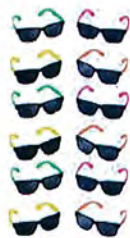
Rhode Island Novelty Neon