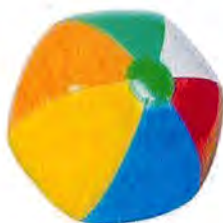
12 Rainbow 16" BEACH