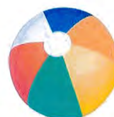
12 JUMBO 24"