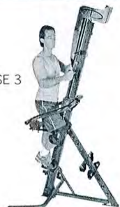
FULL WEIGHT BEARING

“SRM VersaClimber is exactly what I needed to implement isolated weight bearing and non-weight bearing rehabilitation.”