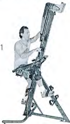
NON WEIGHT BEARING