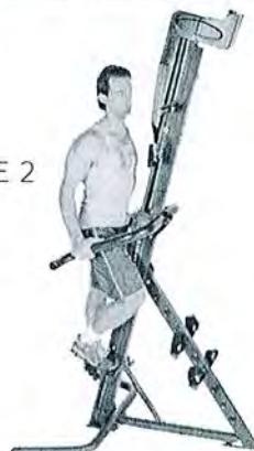
PARTIAL WEIGHT BEARING