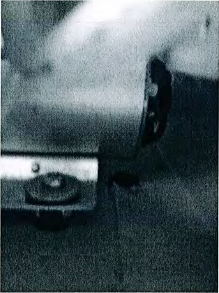
Small pile of dark 'powder' below base of pump