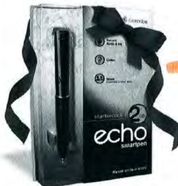
Roll over image to zoom in