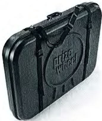
Roll over image to zoom in