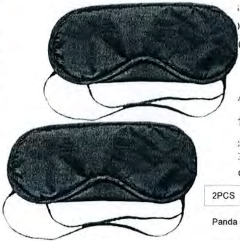
Roll over image to zoom in

Outdoor Air Travel Sleep Sleeping Rest Sweet Dreams Comfort Eye Mask Shades Blindfold