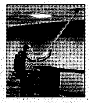
Aluminum telescoping wand allows easy access to a wide variety of areas.