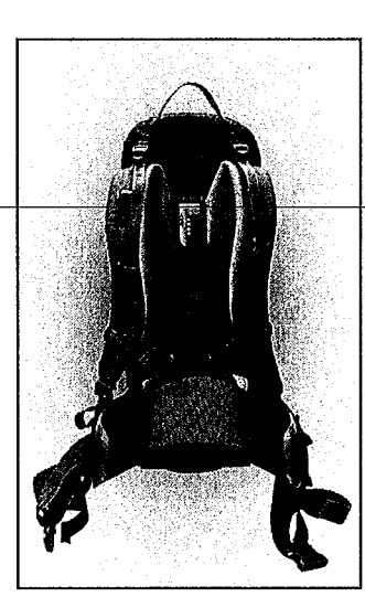
DEUTER AIRCOMFORT HARNESS Deuter is recognized as a world leading manufacturer of backpacks and hiking equipment.