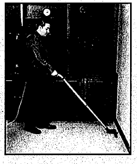
Perfect for cleaning carpet, hard floors and above floor cleaning.