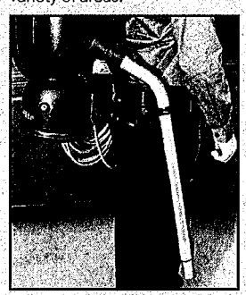
"Hands Free" system allows storing of the tools, including the wand, right on the belt for user convenience.