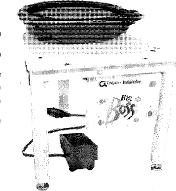
BIG BOSS POTTER'S WHEEL Creative Industries