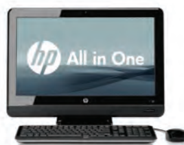
HP 6000 All-in-One Desktop