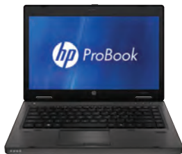
HP Compaq 6460b