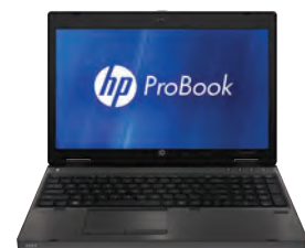
HP Compaq 6560b