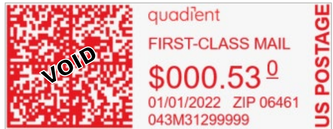
NEW - IMI Example